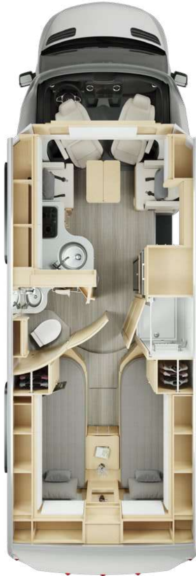
U24TB | Twin Bed