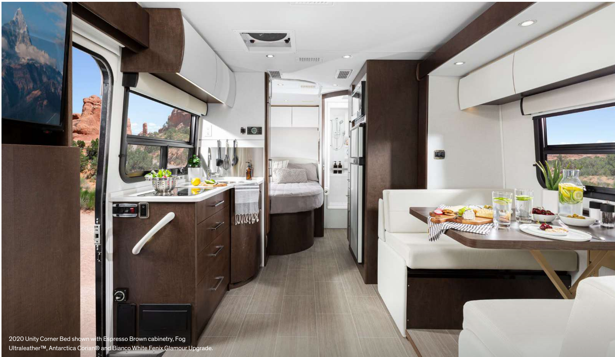
2020 Unity Corner Bed shown with Espresso Brown cabinetry, Fog Ultraleather™, Antarctica Corian® and Bianco White Fenix Glamour Upgrade.