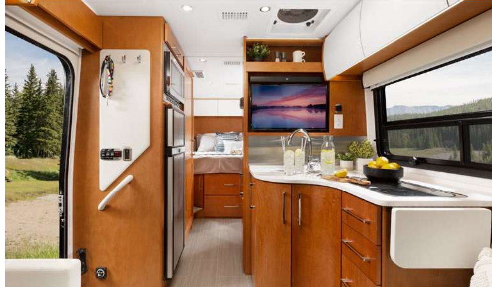
Chestnut Cherry Shown with Bianco White Fenix Glamour Upgrade