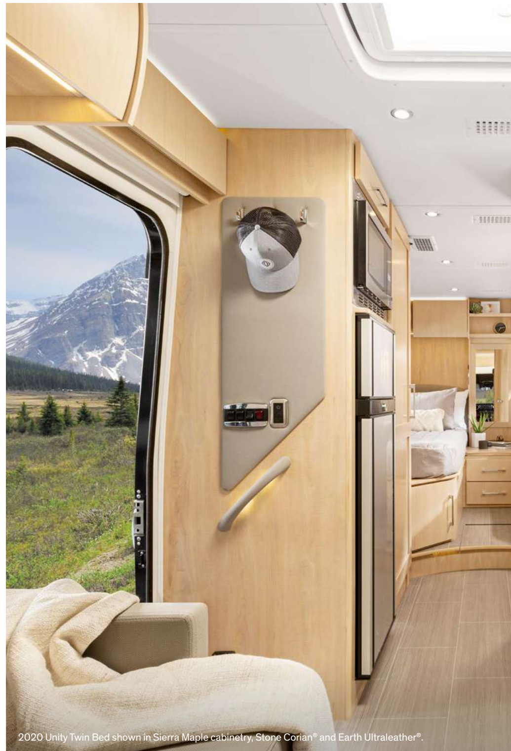
2020 Unity Twin Bed shown in Sierra Maple cabinetry, Stone Corian® and Earth Ultraleather®.