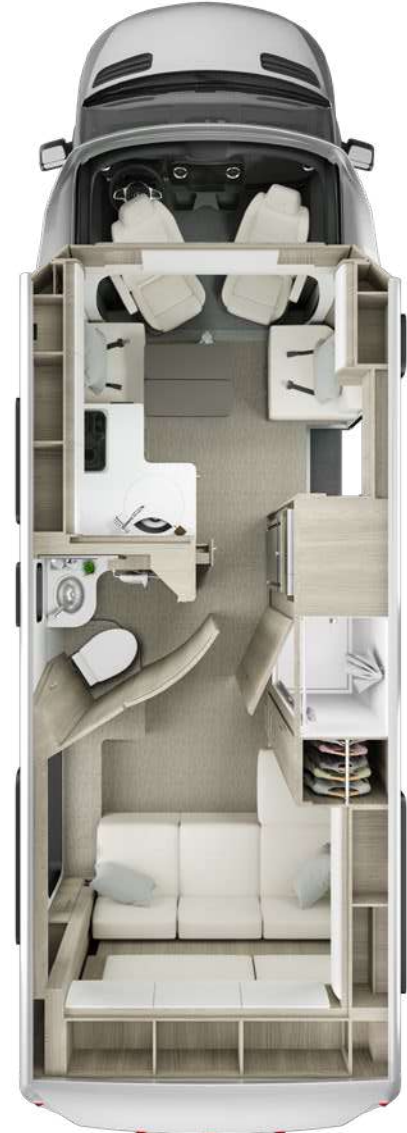
U24RL | Rear Lounge