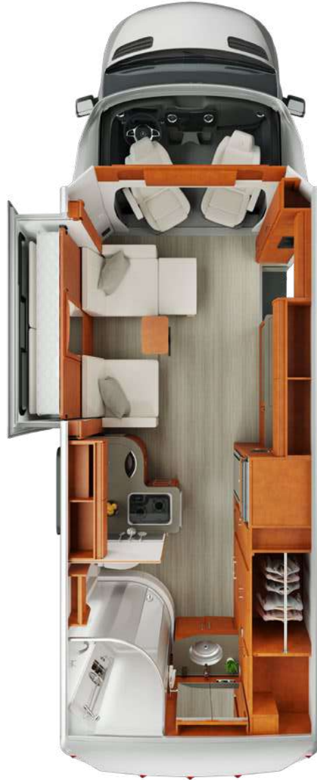
U24MB | Murphy Bed (Shown with standard Leisure Lounge)