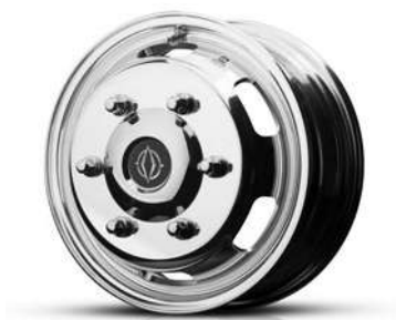
Alcoa Dura-Bright® Aluminum Wheels Optional – All 6 Aluminum Wheels, 4 Dura-Bright® Wheels