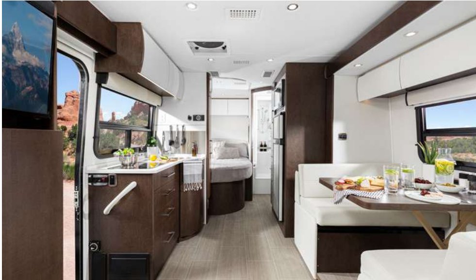
Espresso Brown Shown with Bianco White Fenix Glamour Upgrade