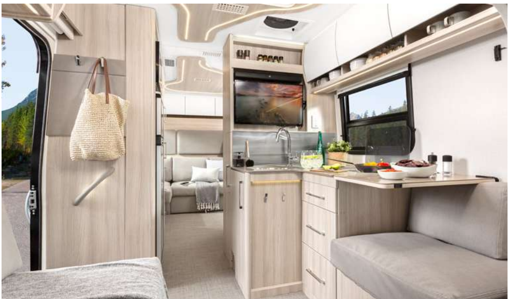
Cashmere (Exclusive to the Unity Rear Lounge) Shown with Bianco White Fenix Glamour Upgrade