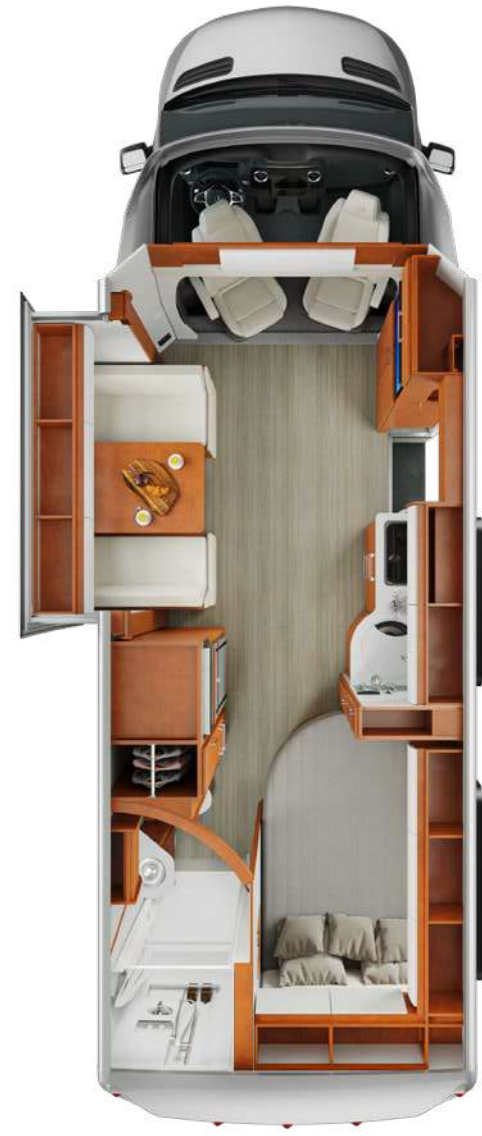
U24CB | Corner Bed (Shown with Standard Dinette)