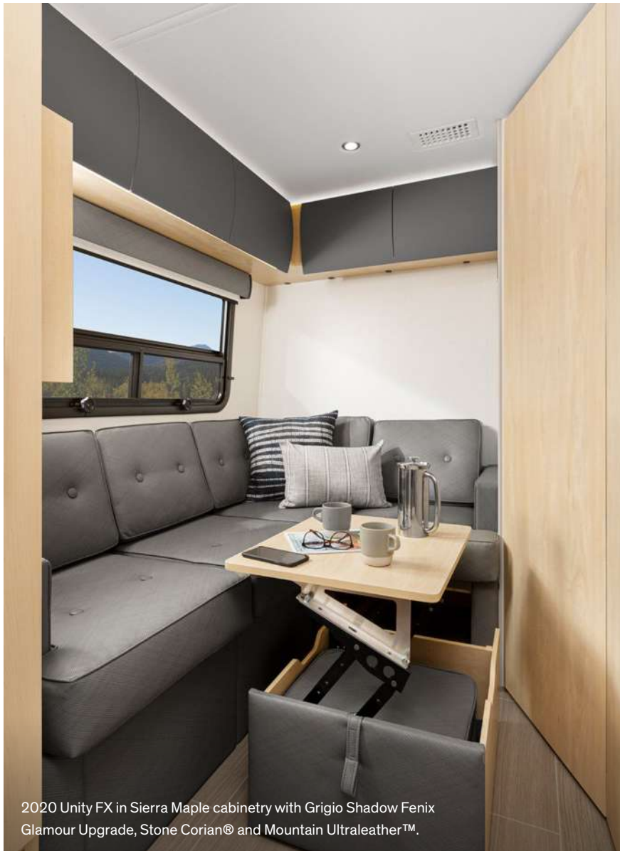
2020 Unity FX in Sierra Maple cabinetry with Grigio Shadow Fenix Glamour Upgrade, Stone Corian® and Mountain Ultraleather™.