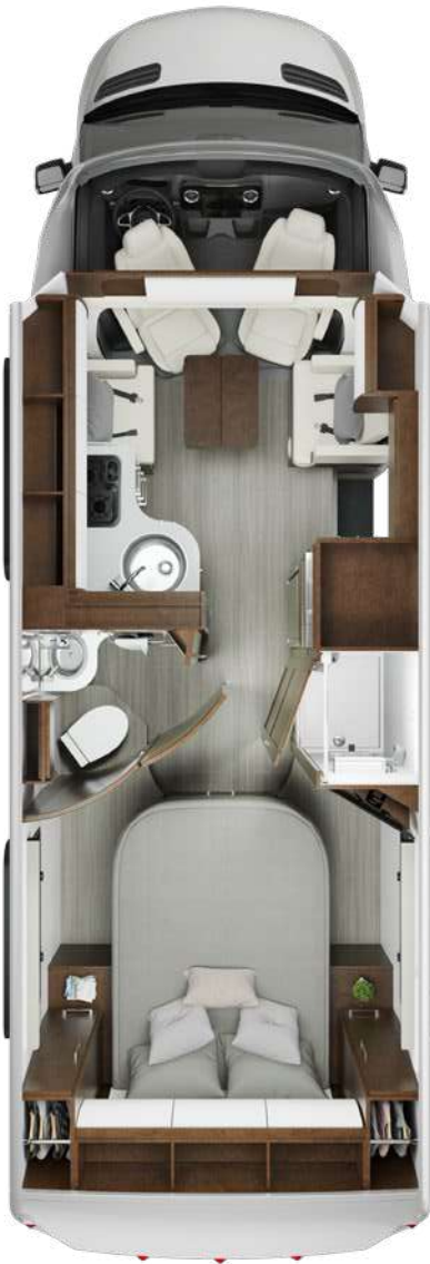
U241B | Island Bed