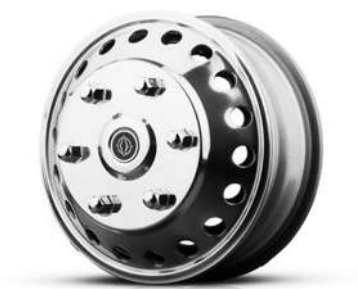
Steel Wheels Standard – With Wheel Simulators