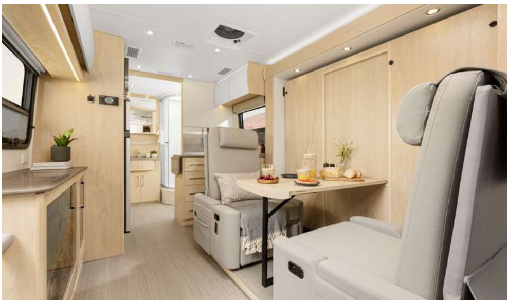
Sierra Maple Shown with Bianco White Fenix Glamour Upgrade