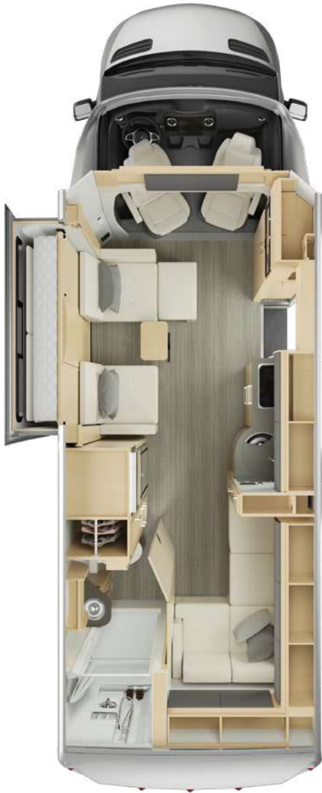
U24FX | FX