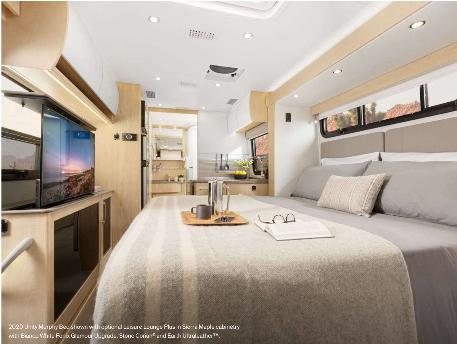
2020 Unity Murphy Bed shown with optional Leisure Lounge Plus in Sierra Maple cabinetry with Bianco White Fenix Glamour Upgrade, Stone Corian® and Earth Ultraleather™.